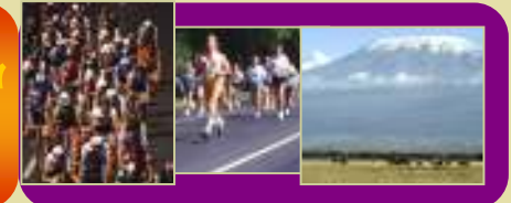
Cape Town Cycle Tour, Comrades, Mt. Kilimanjaro